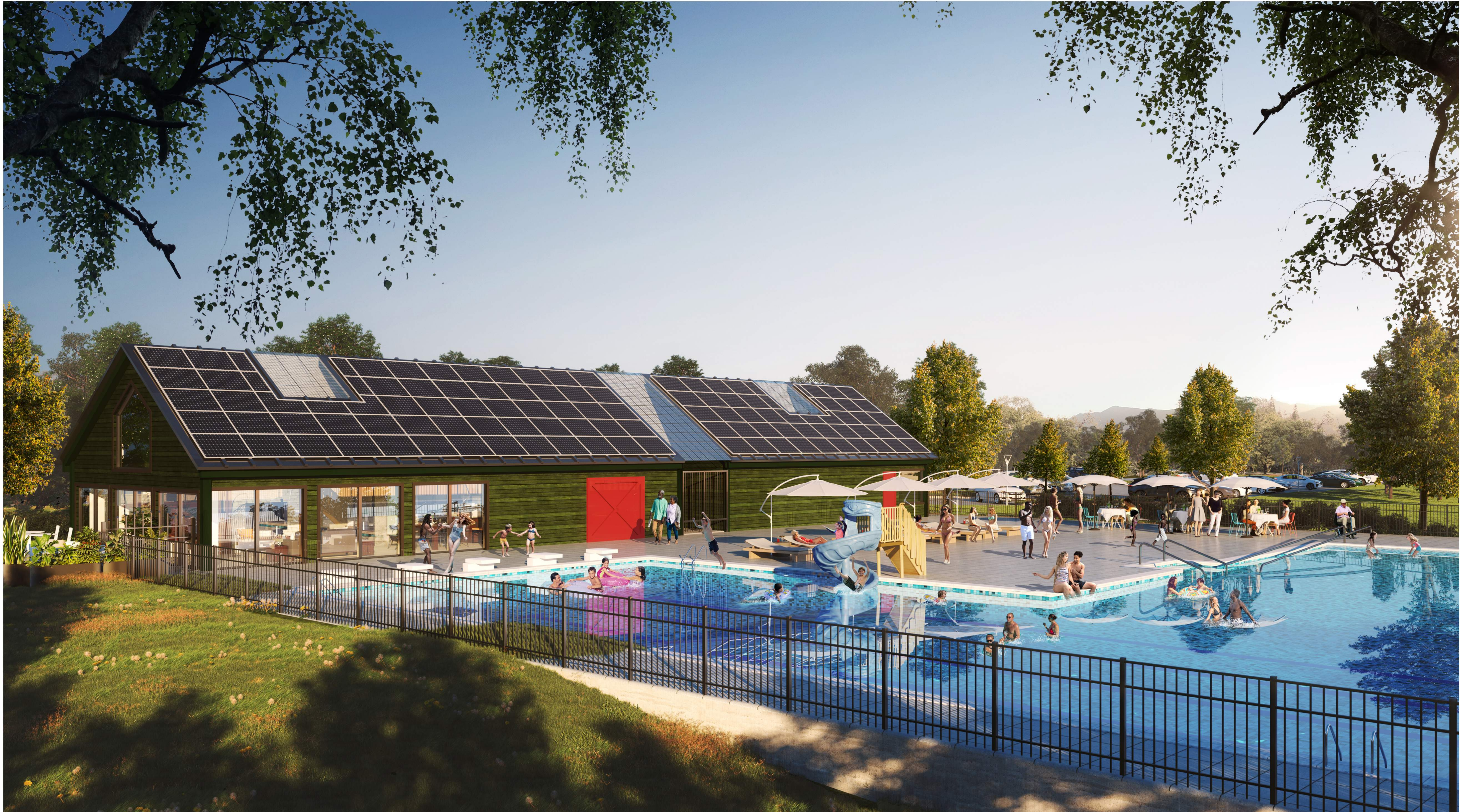
Attachment C: Poolhouse